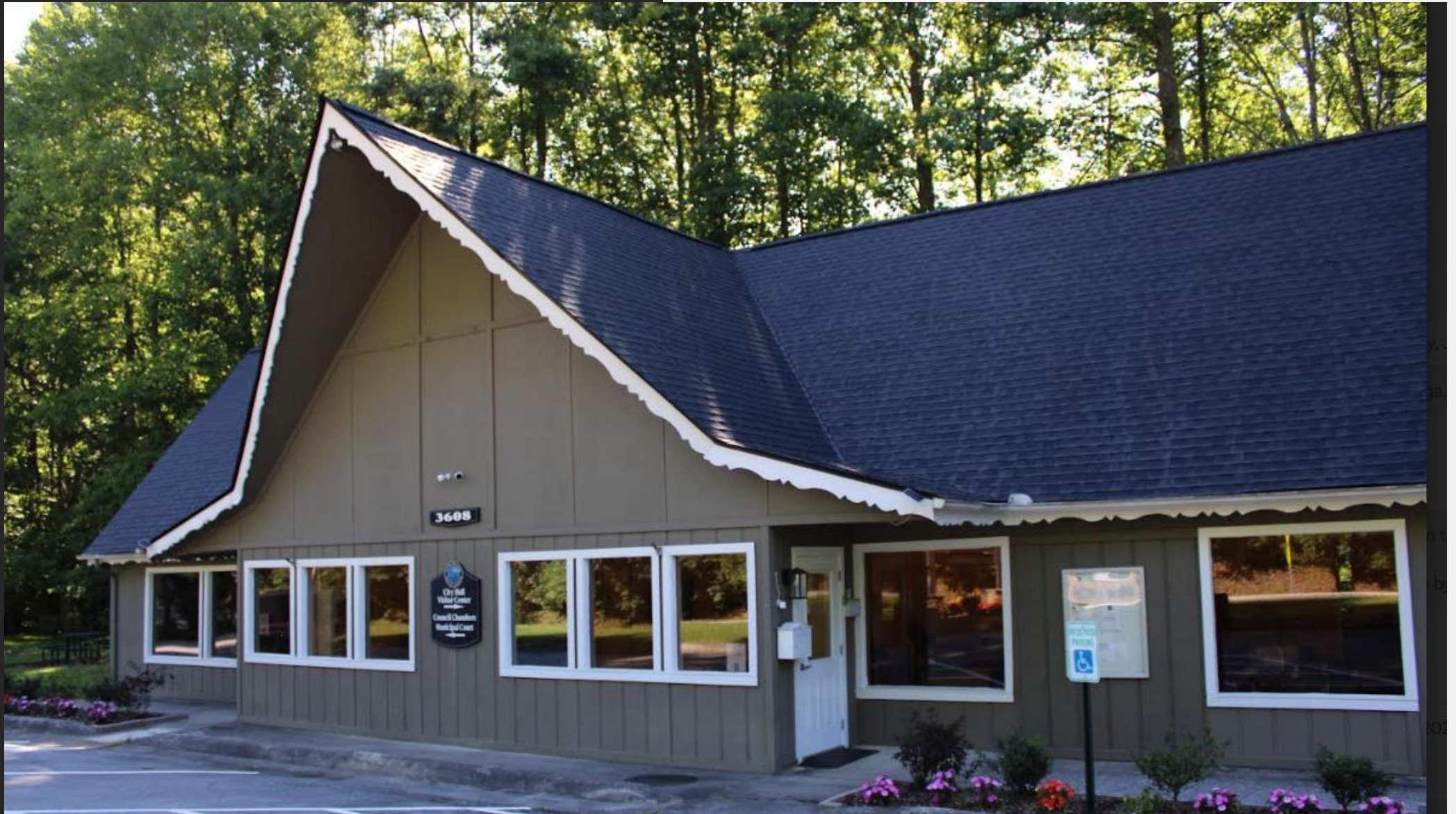
Our new CITY HALL/Visitor Center/Council & Court Meeting Room